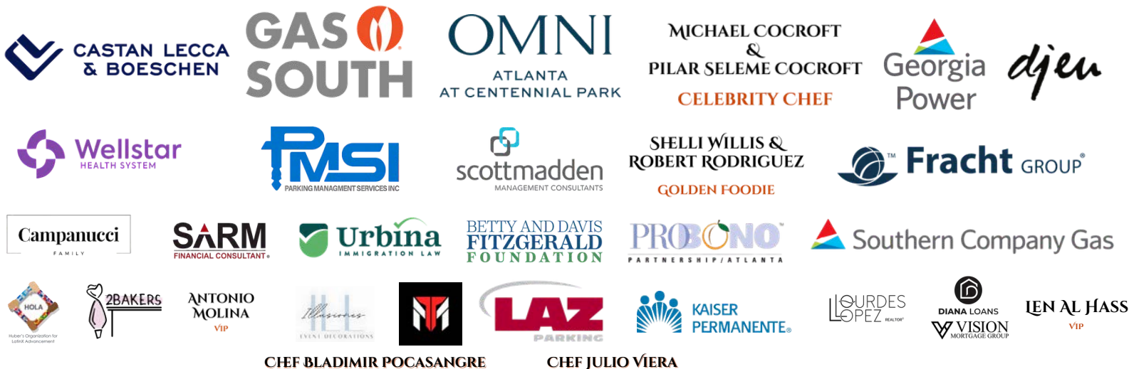
CHEF BLADIMIR POCASANGRE