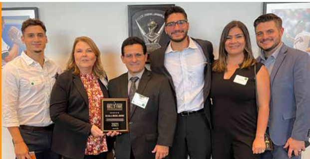
Georgia Hispanic Chamber of Commerce Hall of Fame