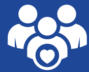
Family Support Christmas Project